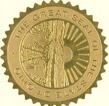
Jon Husted Lieutenant Governor